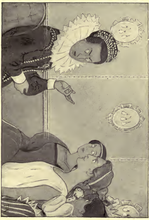
QUEEN ELIZABETH DESIRES AN AXE AND ONE HOUR OF HER OLDEN POWER